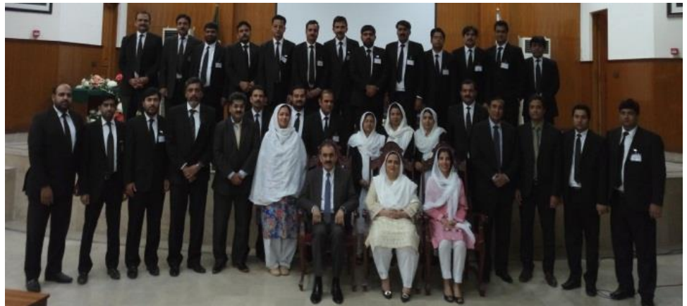
General Training Program for Civil Judges in Group Photo with Hon'ble DG and Faculty Members (160 th Training Course)