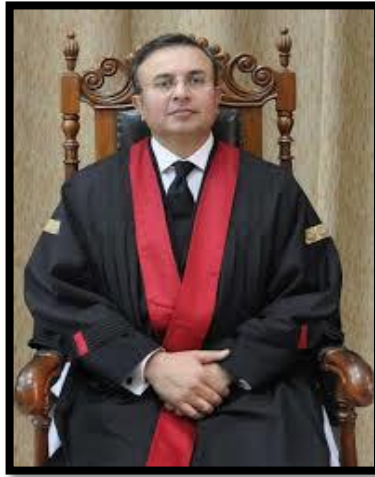
Hon'ble Mr. Justice Syed Mansoor Ali Shah Chairperson Punjab Judicial Academy/ Chief Justice, Lahore High Court