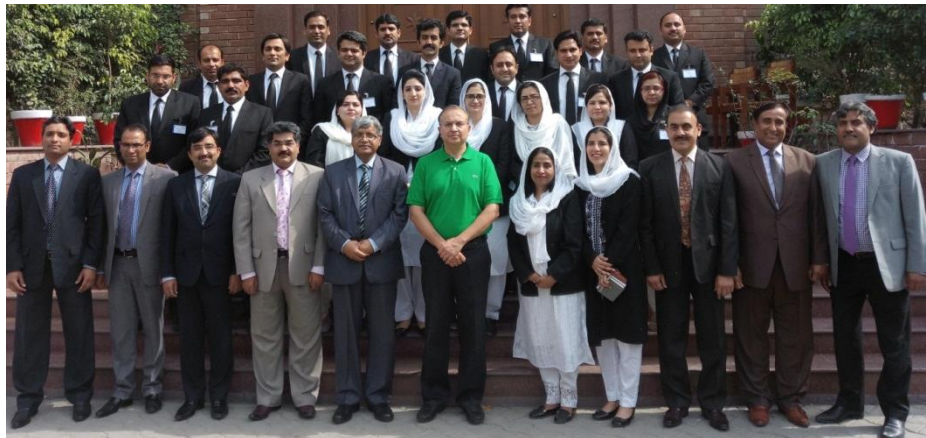
General Training Program for Civil Judges in Group Photo with Hon'ble Chief Justice, LHC, Worthy Registrar, DG, PJA and Faculty Members (143 rd Training Course)