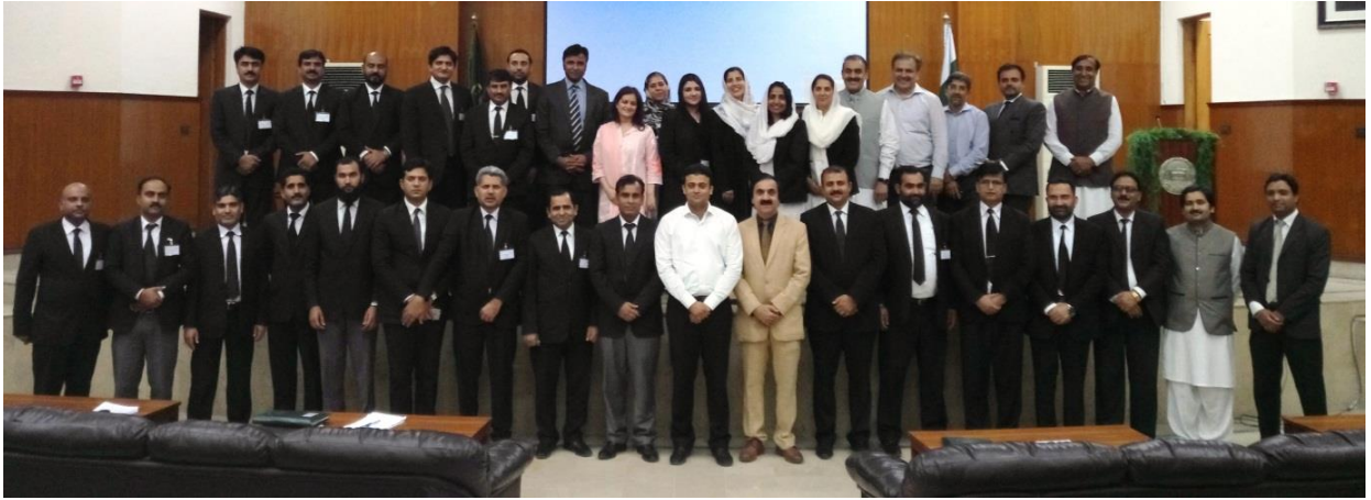
Group Photo with Hon'ble Chief Justice, DG, PJA and Faculty Members