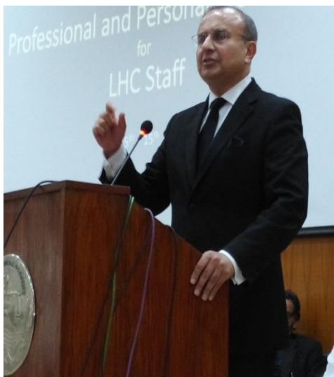
(Hon'ble Chief Justice , LHC)