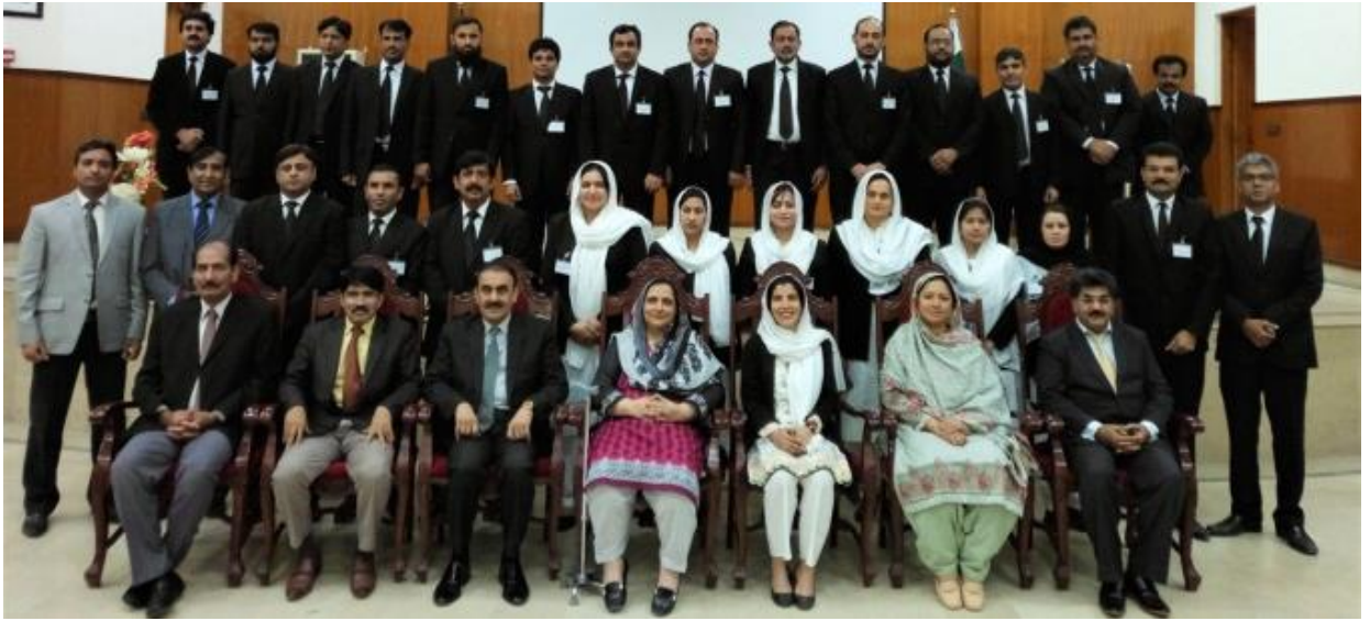
General Training Program for Civil Judges in Group Photo with Hon'ble DG and Faculty Members (149 th Training Course)