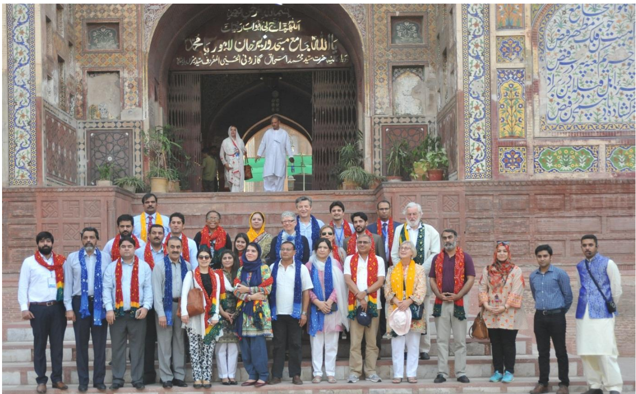
Visit of Masjid Wazir Khan