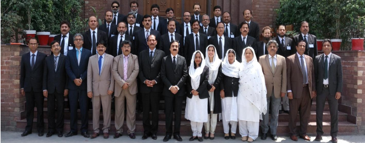
General Training Program for Additional District & Sessions Judges in Group Photo with Hon'ble DG, PJA and Faculty Members (145 th Training Course)