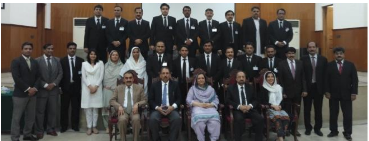
Three Days Orientation Training Course for newly promoted 109-Senior Civil Judges