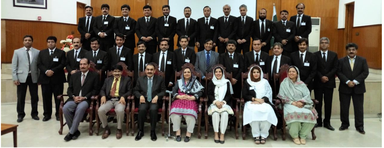
General Training Program for Additional District & Sessions Judges in Group Photo with Hon'ble DG, PJA and Faculty Members (148 th Training Course)