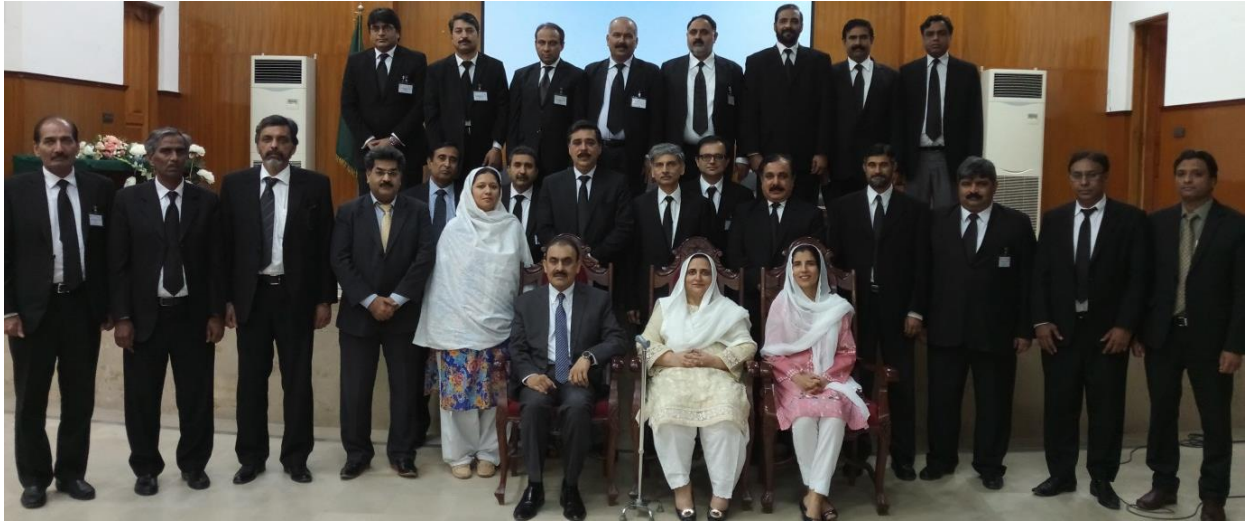
General Training Program for Additional District & Sessions Judges in Group Photo with Hon'ble DG and Faculty Members (158 th Training Course)