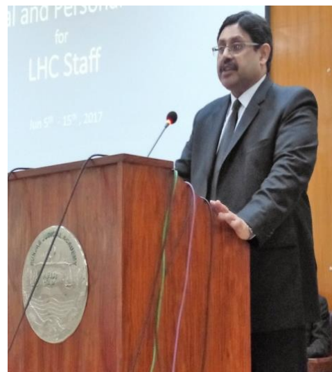
(Hon'ble Justice Shujaat Ali Khan Judge ,LHC)