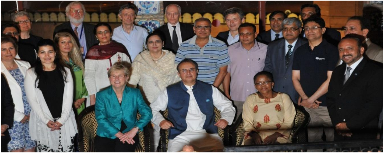
Group photo at Haveli Restaurant