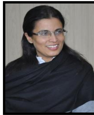
Hon'ble Mrs. Justice Ayesha A. Malik