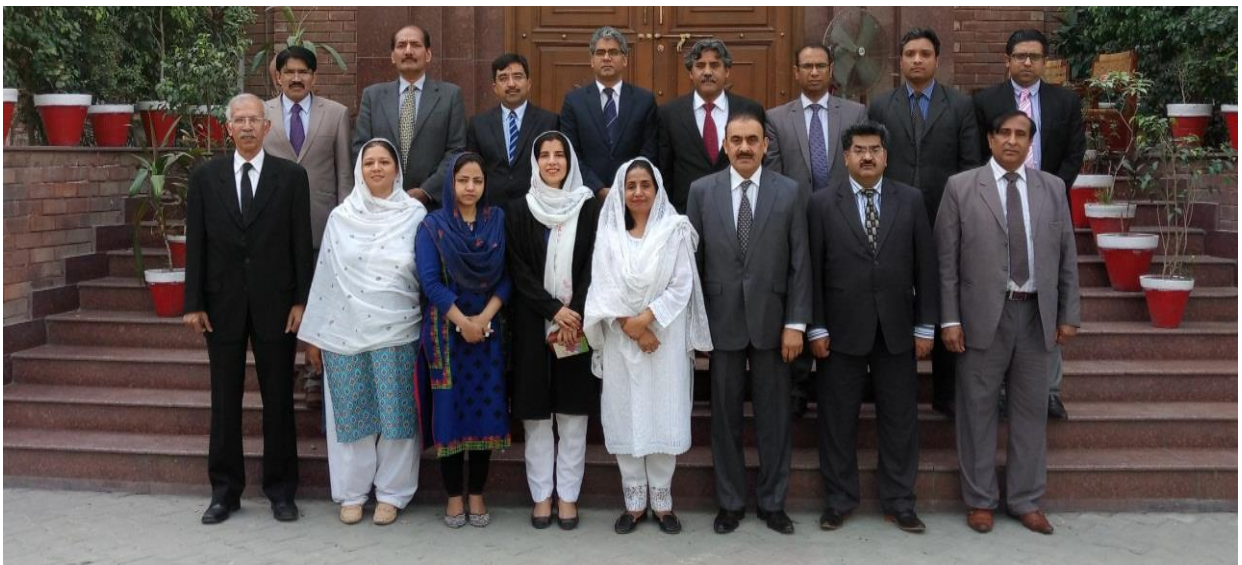
Group photo with the Officers of the PJA