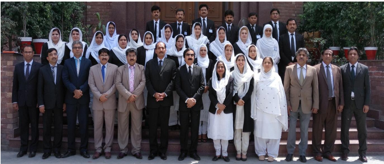
General Training Program for Civil Judges in Group Photo with Hon'ble DG, PJA and Faculty Members (146 th Training Course)