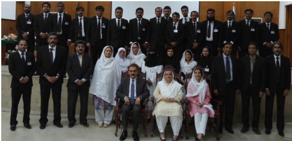
General Training Program for Civil Judges in Group Photo with Hon'ble DG and Faculty Members (159 th Training Course)