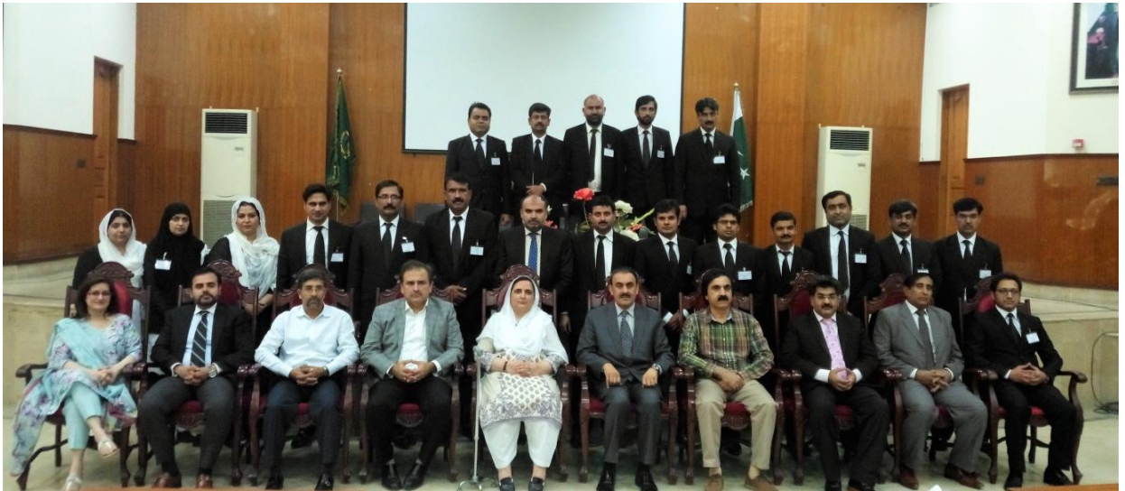
ADR/Mediation Group Photo with Hon'ble Chief Justice, DG, PJA and Faculty Members (152 nd Training Course)