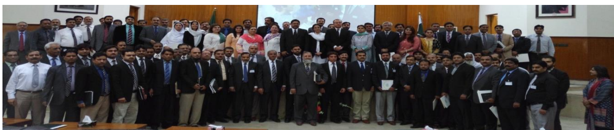
Personal & Professional well-being Ministerial Staff of Lahore High Court (Principal Seat) Group Photos Faculty Members