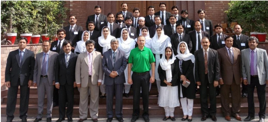
General Training Program for Civil Judges in Group Photo with Hon'ble Chief Justice, LHC, Worthy Registrar, DG, PJA and Faculty Members (142 nd Training Course)