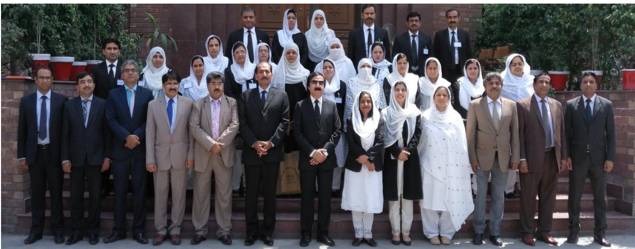
General Training Program for Civil Judges in Group Photo with Hon'ble DG, PJA and Faculty Members (147 th Training Course)