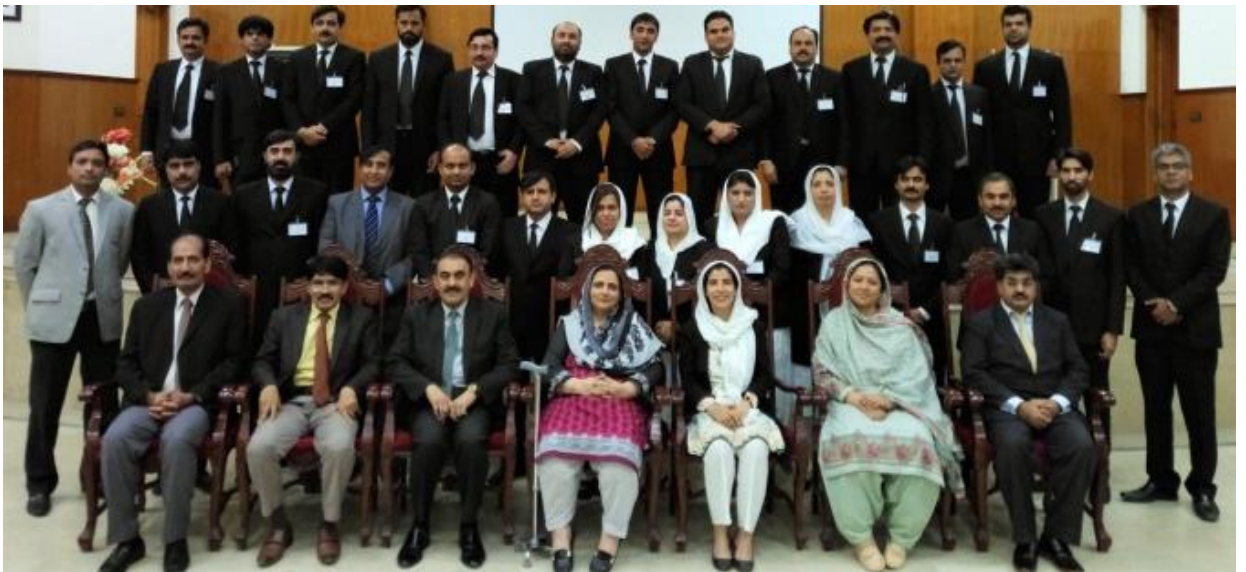
General Training Program for Civil Judges in Group Photo with Hon'ble DG and Faculty Members (150 th Training Course)