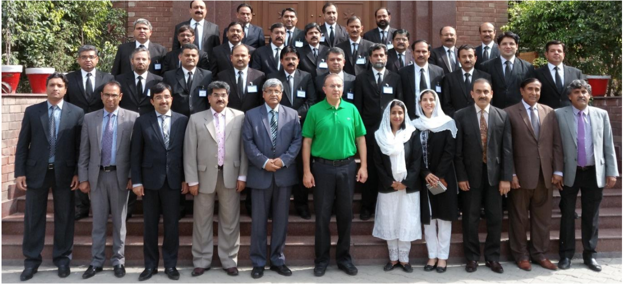
General Training Program for Additional District & Sessions Judges in Group Photo with Hon'ble Chief Justice, LHC, Worthy Registrar, DG, PJA and Faculty Members (141 st Training Course)