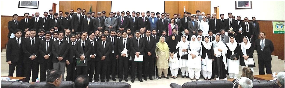
-ADR/Mediation (Batch-3) Group Photo with Hon'ble Chief Justice, DG, PJA and Faculty Members (157 th Training Course)