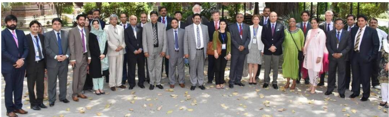
Visit of Lahore High Court